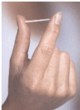
The new IMPLANON™!

With IMPLANON™, just implant and forget it. That's right: no pills, no missed doses, and no accidents. IMPLANON™ 68 mg (etonogestrel implant) is the first and only implantable contraceptive approved by the U.S. Food and Drug Administration for use in the United States. The matchstick-size rod, which releases the progestin etonogestrel, is inserted underneath the skin of the arm just a few inches above the elbow. It provides consistent protection against pregnancy for three years, unless removed. 1 The procedure requires only a local anesthetic and takes four minutes or less.