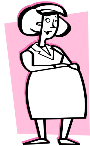
Diagnosis of gestational diabetes is usually done between the 24 th and 28 th week of pregnancy.